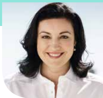
Dorothee Bär State Minister for Digitalisation, Federal Chancellery Keynote speech, Wednesday, 10 April 2019

"Digitalisation represents a turning point in healthcare. The opportunities are huge – in diagnostics for example. At the same time we must ensure that individuals are in control of their data."