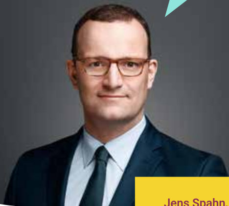
Jens Spahn, Federal Minister of Health Keynote speech, Tuesday, 9 April 2019

"Digitalisation will improve patient care by ensuring broader and faster communication, less bureaucracy, and a more rapid implementation of research findings. This can only be achieved by taking the necessary measures to protect data privacy in cooperation with all the stakeholders involved. We should take this opportunity to shape the digital healthcare system more actively than in the past."